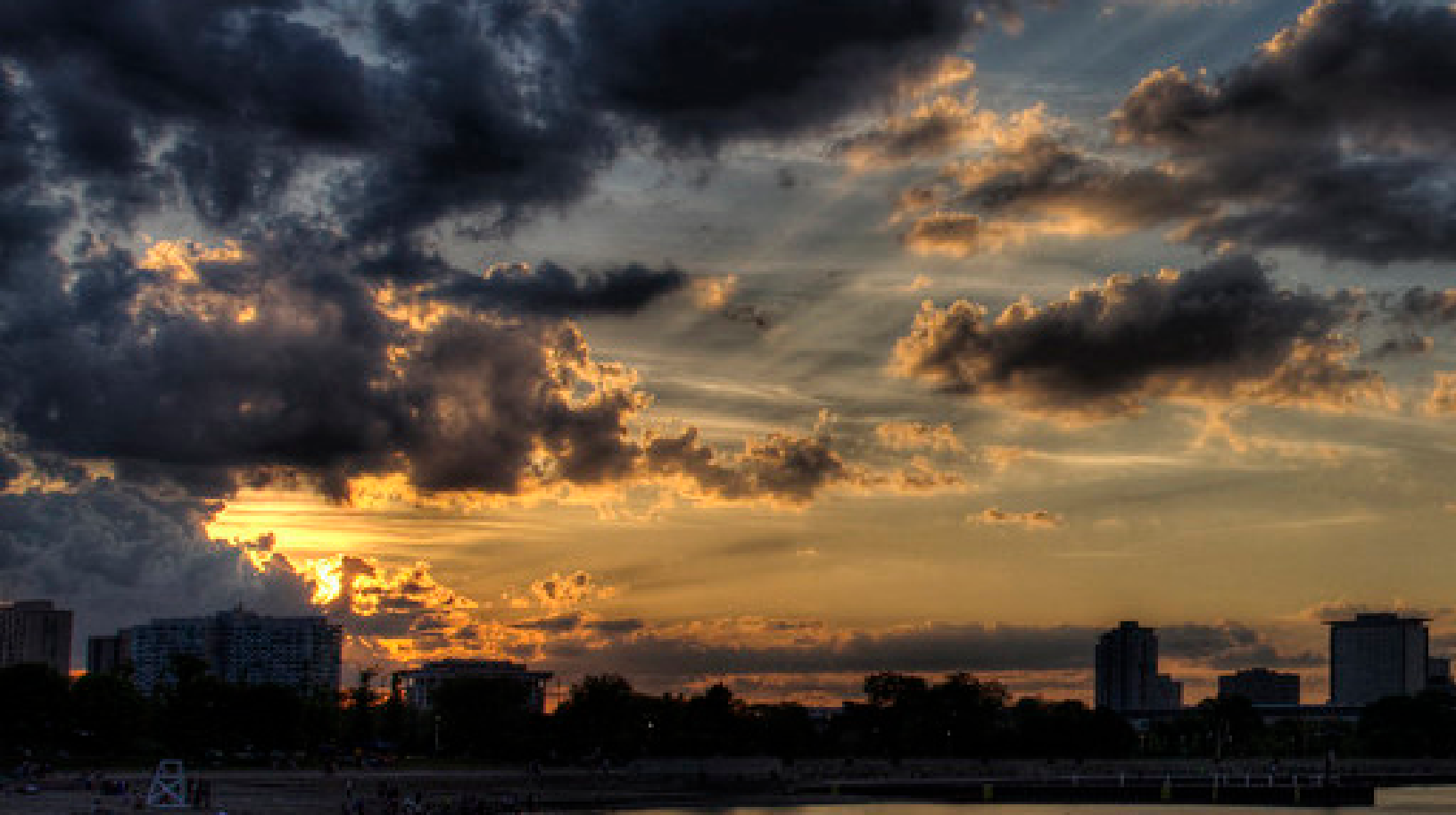
"Chicago Beach" by Edzed Photography